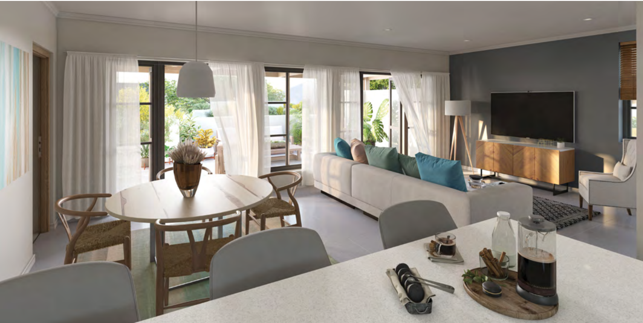
A typical townhouse open-plan living area

Artist's impression only, for details visit: https://fynbosvillage.com/disclaimer/