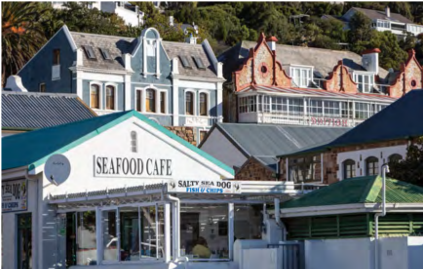
The famous Salty Sea Dog fish restaurant in Simon's Town