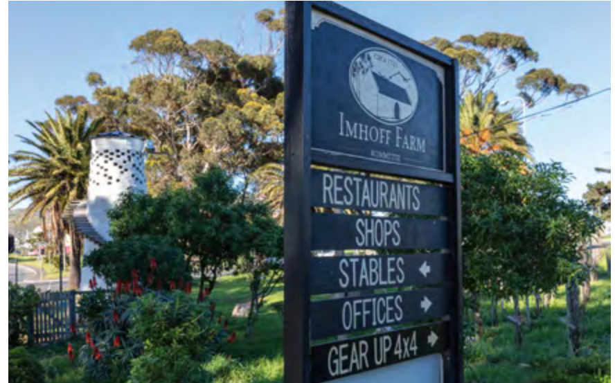
Imhoff Farm offers a variety of activities for different tastes