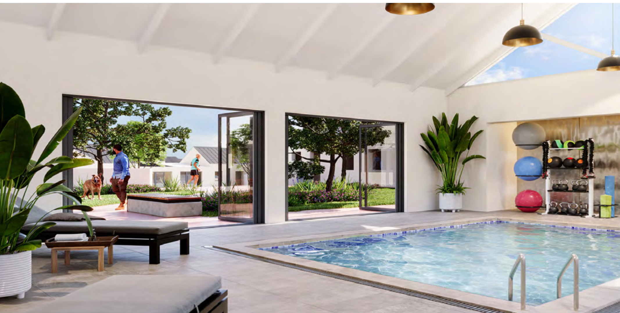
The indoor heated swimming pool and exercise area

Artist's impression only, for details visit: https://fynbosvillage.com/disclaimer/