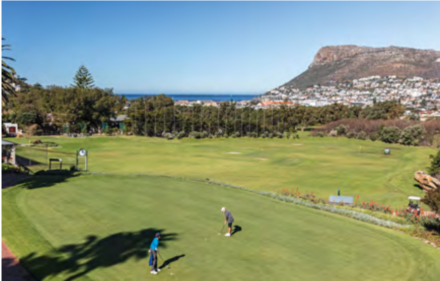
The practice green at Clovelly Country Club and Golf Course