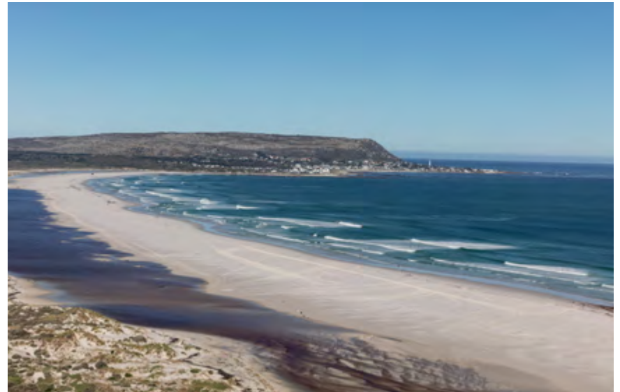
Noordhoek Beach looking towards Kommetjie, viewed from Chapman's Peak