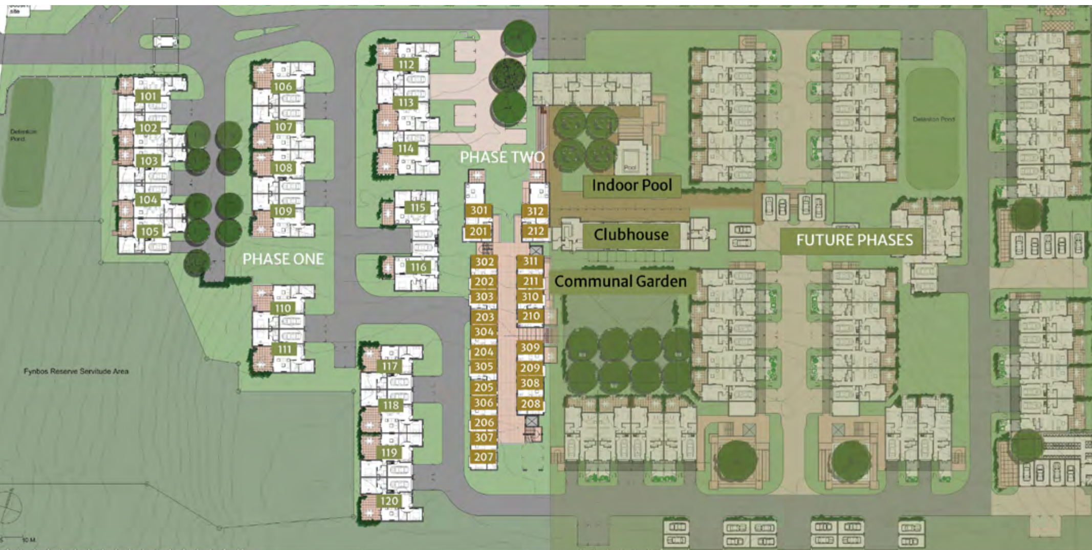
Fynbos Village Site Plan Phases 1 & 2 Now Available