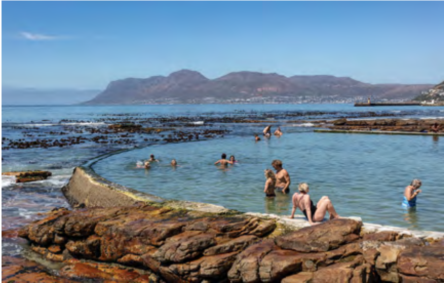
Dalebrook: one of many top surf spots, beaches and tidal pools to choose from