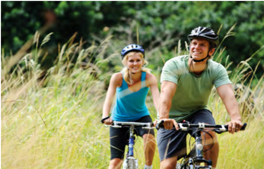
Mountain biking and cycling are popular pursuits