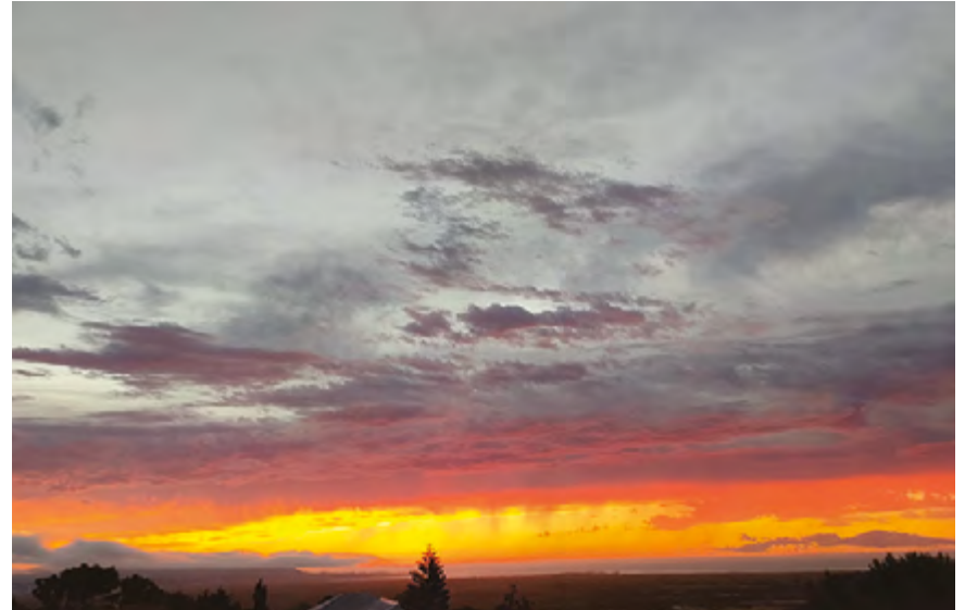
Sunset at Noordhoek beach