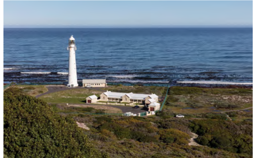
Explore the South Peninsula – Slangkop lighthouse at Kommetjie