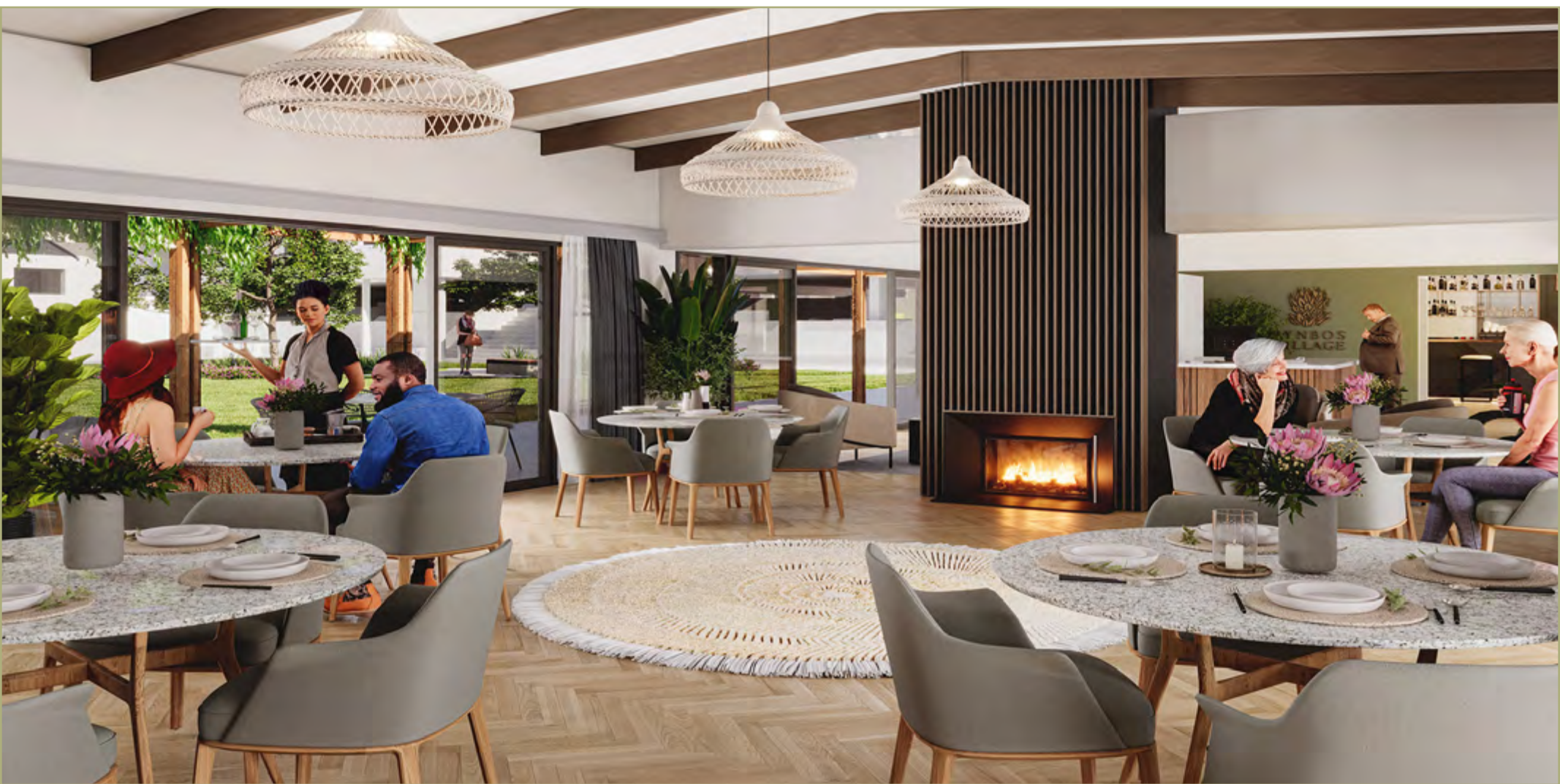
The clubhouse showing the dining and entertainment area with reception and bar in the background

Artist's impression only, for details visit: https://fynbosvillage.com/disclaimer/