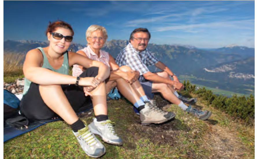
Stunning views reward hikes on the surrounding mountain peaks