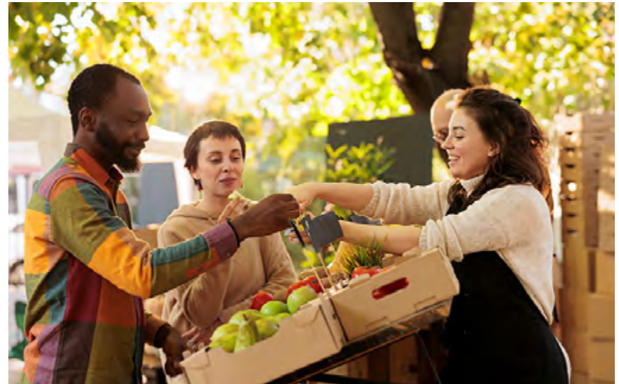
Regular fresh organic produce markets are a feature of life in Noordhoek Valley