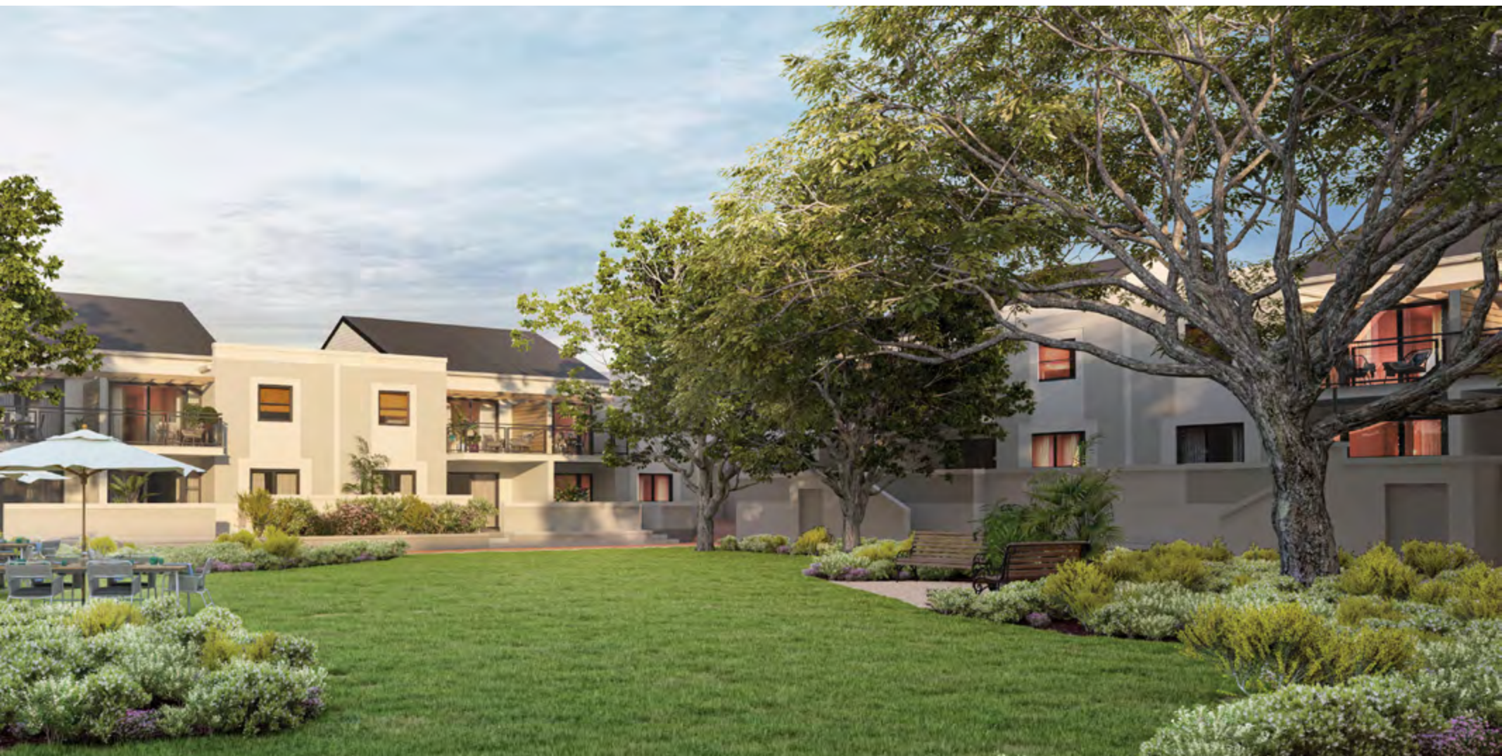
The garden to the south of the clubhouse

Artist's impression only, for details visit: https://fynbosvillage.com/disclaimer/