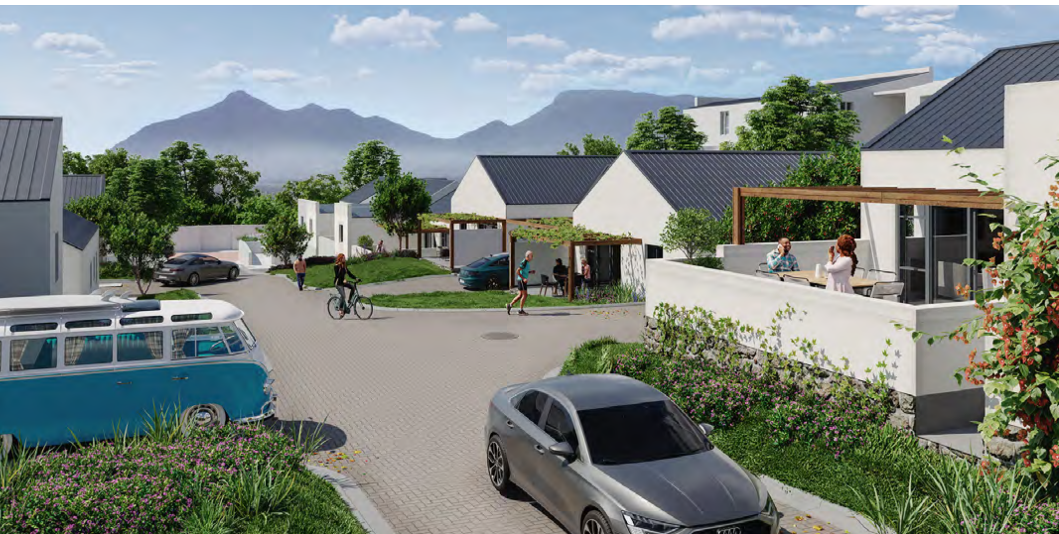
A typical street of luxury townhouses

Artist's impression only, for details visit: https://fynbosvillage.com/disclaimer/